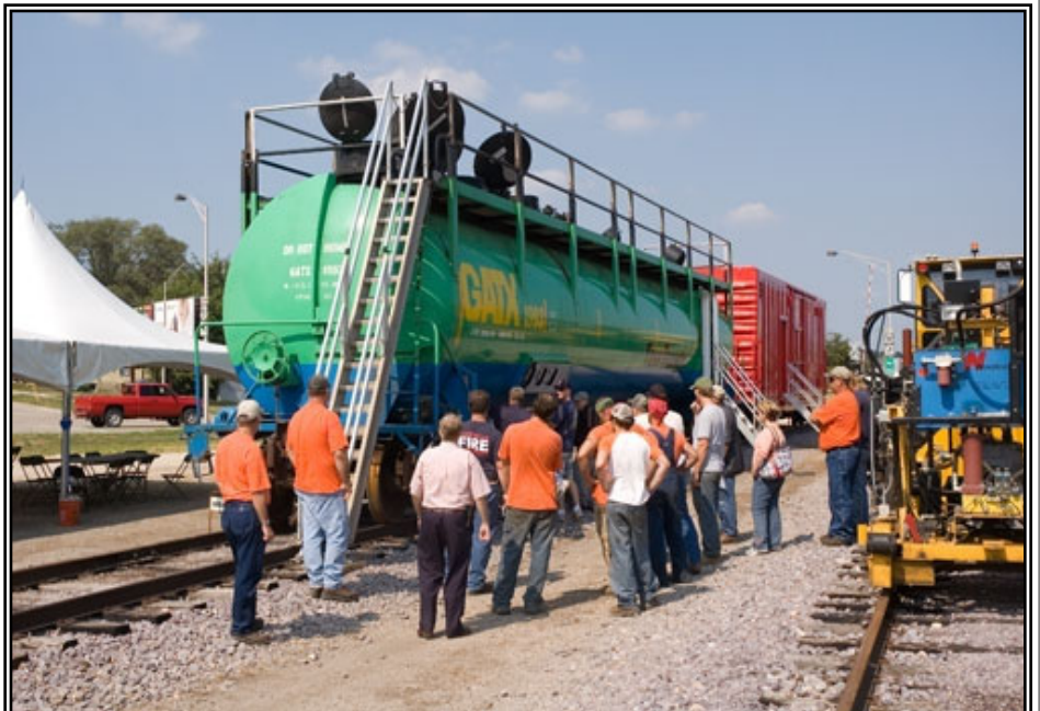
Above: A GATX Tank car "Trainer" used for demonstration purposes all around the country. The tank car shown above is a walk-through car that demonstrates the proper handling of internal and external valves associated with various chemicals.

By assisting state, county & local emergency responders in mock training exercises, the WSOR helps build understanding and awareness of emergency situations that will ultimately save lives in the future.