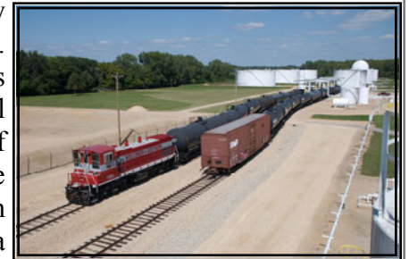
July 2009, U.S. Oil Co. Rail load-out site.

Natural Gasoline dilutes crude oil which allows the tar sand which is a heavy Canadian crude oil to flow through the pipelines back into the United States. There is a shortage of diluents accessibility in Northern Alberta. U.S. Oils partnership with Tidal Energy created a logistical solution to pipe Natural Gasoline from the Gulf Coast and Midcontinent territories into their "state of the art" facility located in McFarland, WI. U.S. Oil provides storage space and has recently finished the construction of a tank car loading terminal on the WSOR. From the first day on-line this facility began loading 8 rail cars a day which equates to operating at 100% planned utilization. Due to time constraints regarding filing permit documents and typical construction scheduling, U.S. Oil was extremely sensitive to the needs relating to the demand in the marketplace for their Natural Gasoline. Rather than waiting for the new facility to be completed which essentially would have left their partner short on product, U.S. Oil looked to find another creative short-term alternative method of transportation. In late 2008 U.S. Oil and the WSOR developed a program that proved to be a win-win scenario for both organizations... a local transloading site was dedicated to this business. Even through the battles of an extremely volatile winter season, this temporary logistical alternative was deemed to be extremely successful.