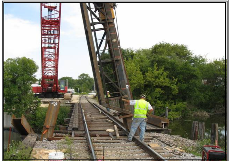
Above: Bridge contractors reconstruct WSOR bridge at Whitewater, WI. August 2009.

WSOR’s 2009 Capital Plan includes approximately $10 Million in planned improvements to existing infrastructure and approximately $15 Million in new railroad infrastructure. Planned improvements include: Installation of 7 miles of continuous welded rail (including switches and crossing renewal) between Milton Junction and Edgerton, WI in Rock County; Installation of nearly 40,000 ties between Janesville and Monroe in Rock and Green Counties; and Complete reconstruction of 12 public at-grade railroad crossings and switch replacement in Milwaukee and Washington Counties. These three capital projects will consume close to $10 Million and will be funded using a variety of public and private funding sources. All are expected to be underway in late 2009 or early 2010.