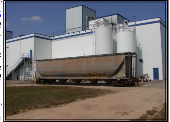
August 2009, Rail unloading area for B&G Foods

This year alone, WSOR estimates it will import almost 5,000 tons of wheat flour into the area for the production of B&G’s signature line Cream of Wheat Product.